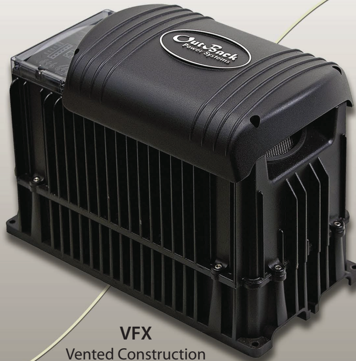
VFX Vented Construction